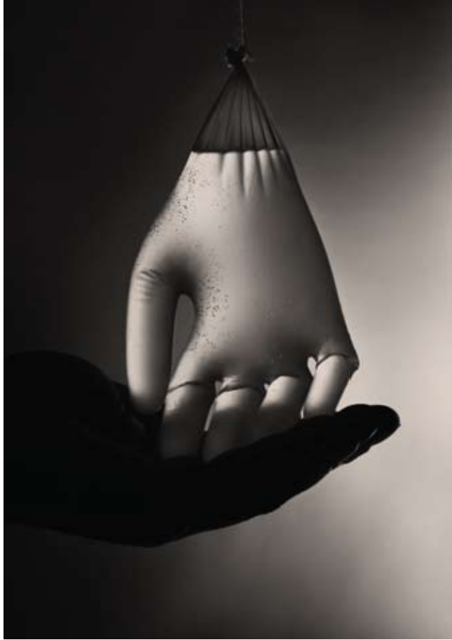
Glove Study #1

household glove to the standard surgical glove, but none of these satisfied the special quality of light that was needed to execute my vision. Luckily I was able to find these unusual household gloves at the 99-cent store that had the exact properties I was looking for. Their diaphanous quality was a perfect fit for my project since I was filling these so-called containers with water. I destroyed many gloves along the way in hopes of metaphorically communicating the transient stages of death as it might befall upon an inanimate object.