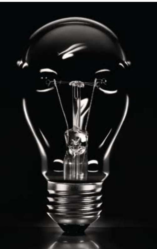
Face Study #4