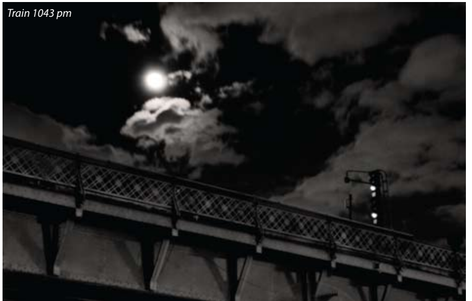
Train 1043 pm

After the images were captured digitally, I would develop the RAW files in Photoshop and then employ only basic burning and dodging techniques in order to bring out the subtle details already inherent in the ice block's structure.