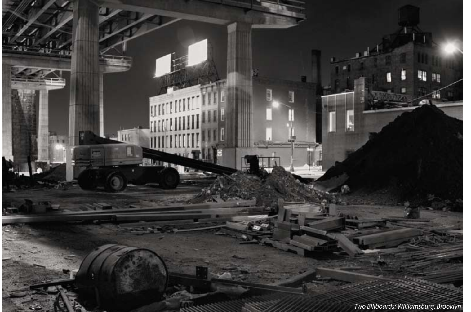
Two Billboards: Williamsburg, Brooklyn