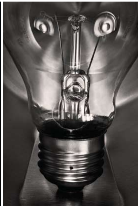
Face Study #1