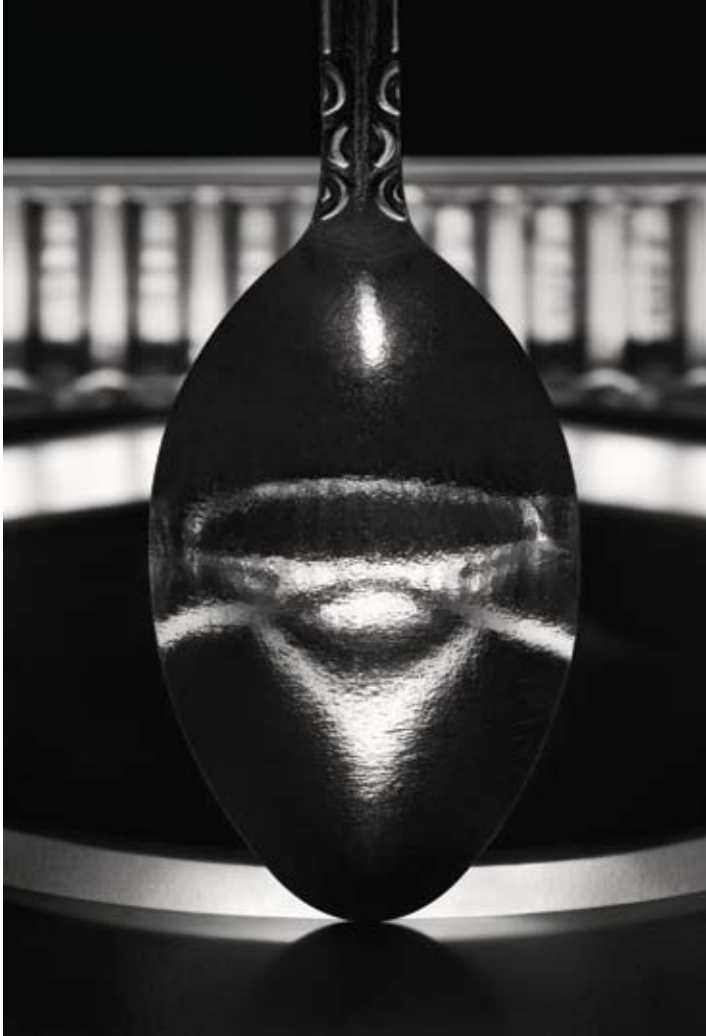
American Bill Design