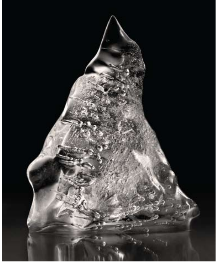
From the Ice series

WC: I prefer black-and-white imagery because its tones are more akin to musical scale. Tonality becomes a very sensual and important tool for expressing mood in black-and-white photographs, and I feel more comfortable in its monochromatic space. However, that's not to say I don't enjoy making color pictures.