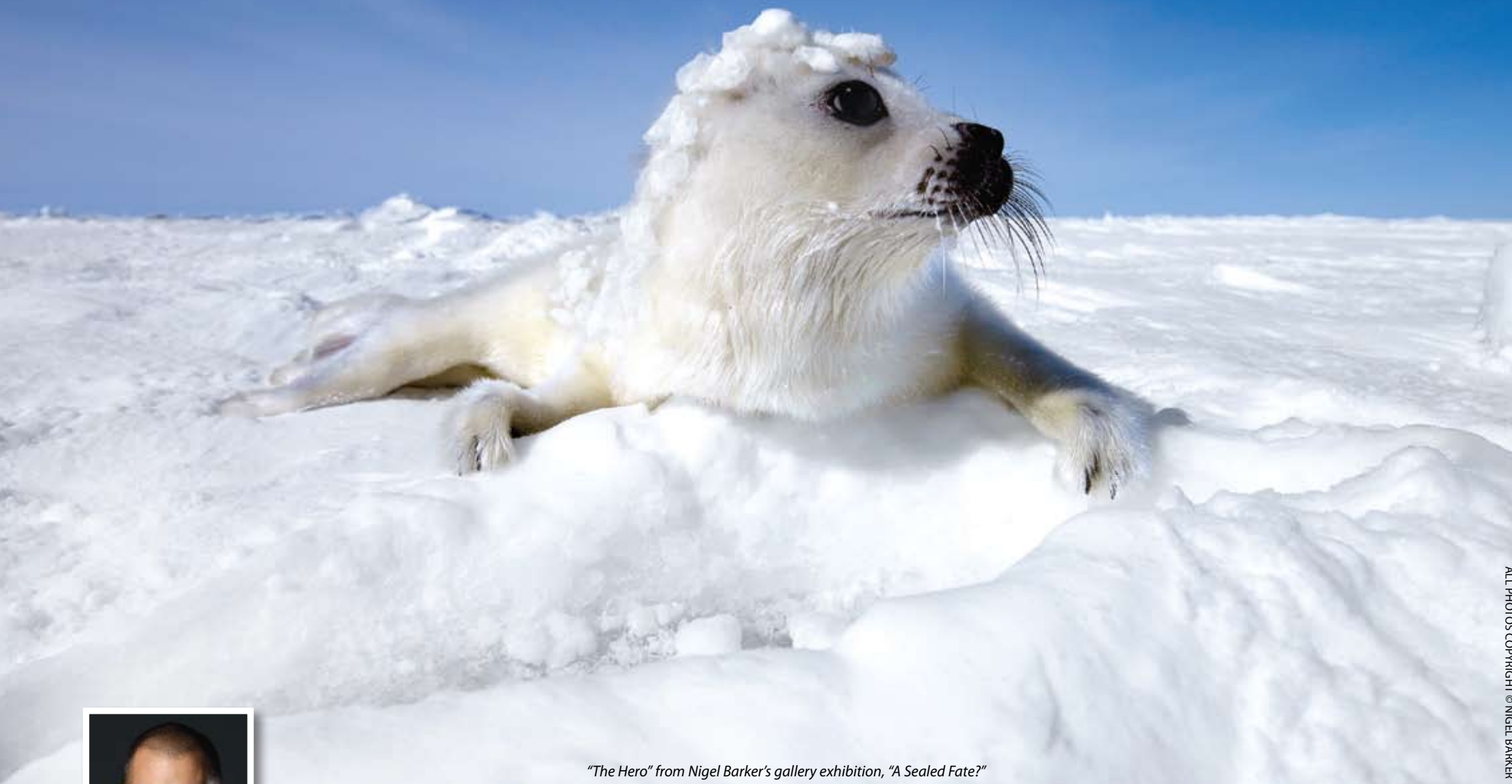
"The Hero" from Nigel Barker's gallery exhibition, "A Sealed Fate?"