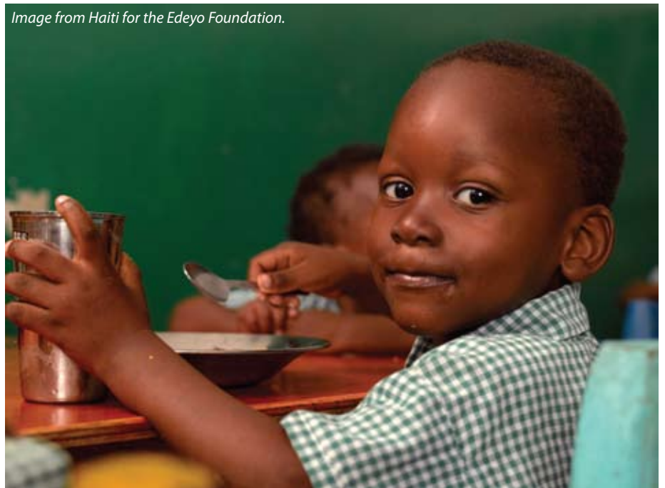
Image from Haiti for the Edeyo Foundation.