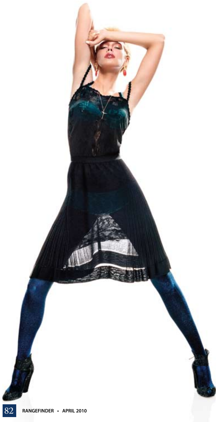
Left: Fashion editorial for Cover Magazine

guns pointed at him and a fight over photographing gambling. “Photographers have a history of putting themselves in harm’s way. I’m certainly not the first to have a gun pointed at me. Ironically, the images from the exhibition that are the most peaceful and serene are the ones in the cemetery,” says Barker. He continues, “[In the cemetery images] the sun is cresting over a tombstone and peeking around a cross and cascading rays of light across the image in a beautiful way. At the same time, there were people screaming and crying and guns were being pulled, but you obviously can’t hear that in a photograph.”