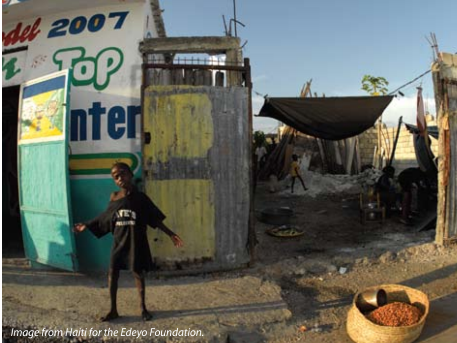
Image from Haiti for the Edeyo Foundation.