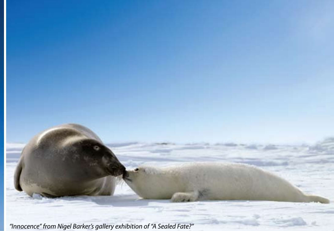
"Innocence" from Nigel Barker's gallery exhibition of "A Sealed Fate?"