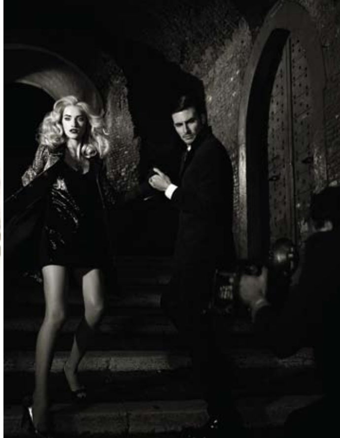
Above left: Beauty editorial shot for Cover Magazine